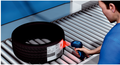
Tire identification in factory automation: Highly reliable thanks to IP65 industrial enclosure rating and rugged housing.

ly due to its triple read feedback via LED, beeper, and vibration. The wireless variants deliver flexibility and mobility. The combination of reliable code reading, rugged design, and SICK connectivity enables use in an extremely wide range of industrial fields of application.