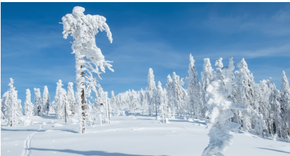
Winter in Siberia: -40 °C. While others freeze, the IMS works perfectly

Mobile machines can be used in any weather. Impacts and vibrations as well as rain, snow, frost, dirt, oil residues, cold or heat heavily impact the sensors installed in the machines. Other factors are aggressive machine cleaning processes. IMF inductive proximity sensors master these challenges with their tight and rugged design. The IP68 and IP69K enclosure ratings, high impact and vibration resistance as well as wide specification limits enable maximum operating times for your machine.