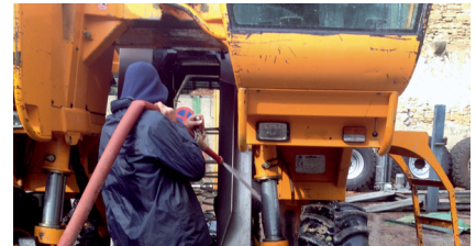
The very tight IMS housing withstands regular high-pressure cleaning without any problems