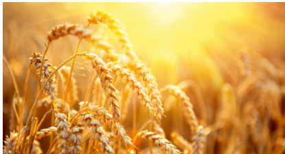
Grain fields in summer: Even at very high temperatures, the IMS shows no weakness